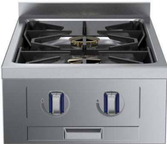
588527 (MBGCBBDOPI) 2-Burner gas Top, ecoflam, one-side operated with backsplash